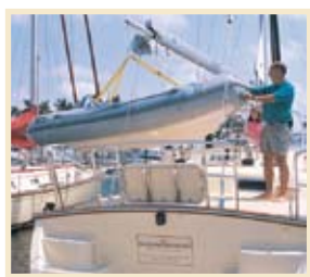
Large aft deck: used for dinghy storage w/optional lift, sundeck or impromptu dining. (Shown in use on the IP485)